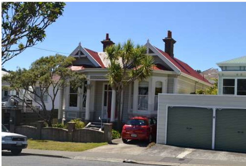
A ceiling detail; and one of the houses in Northland