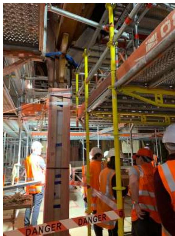
The interior of St Paul's undergoing strengthening work in January 2020