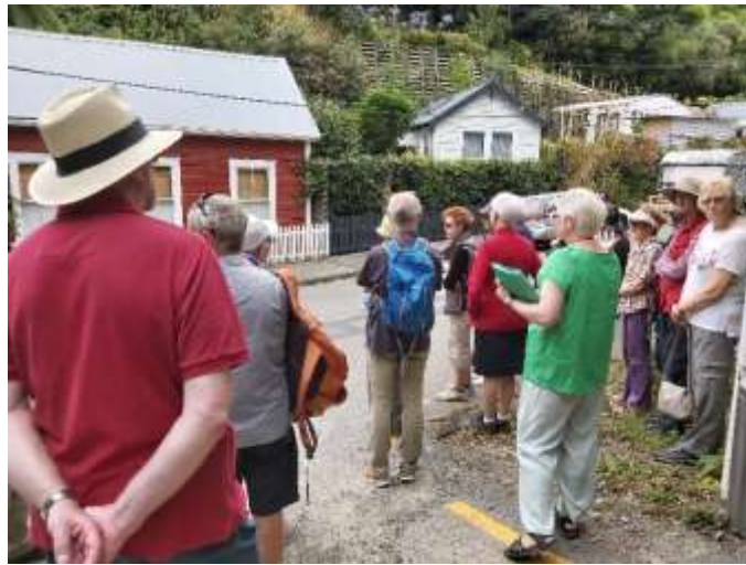
Visit to 186 Oriental Parade. Holloway Road visit